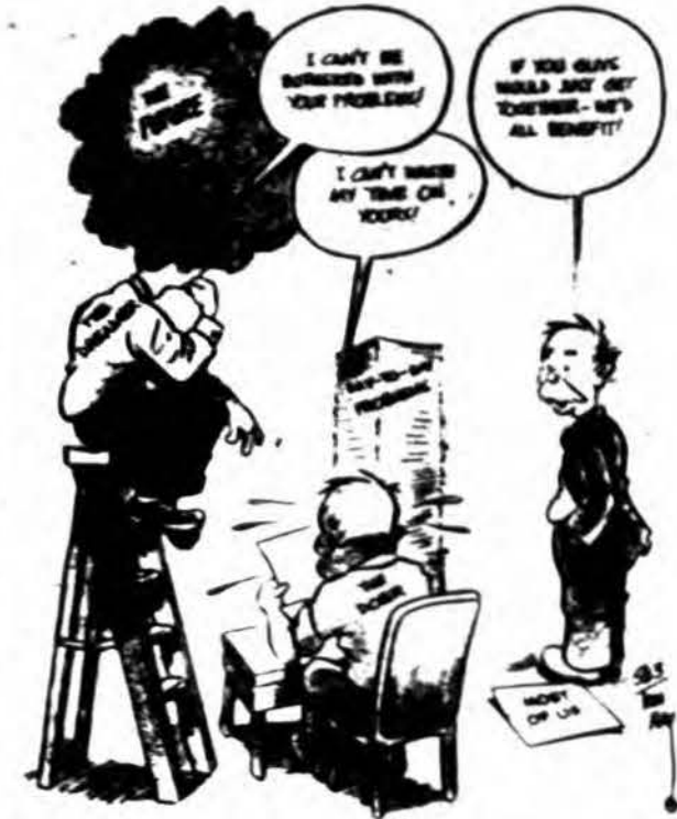
Both Essential to Our Economy

OPERATING DEFICIT The State general fund showed an operating deficit of some