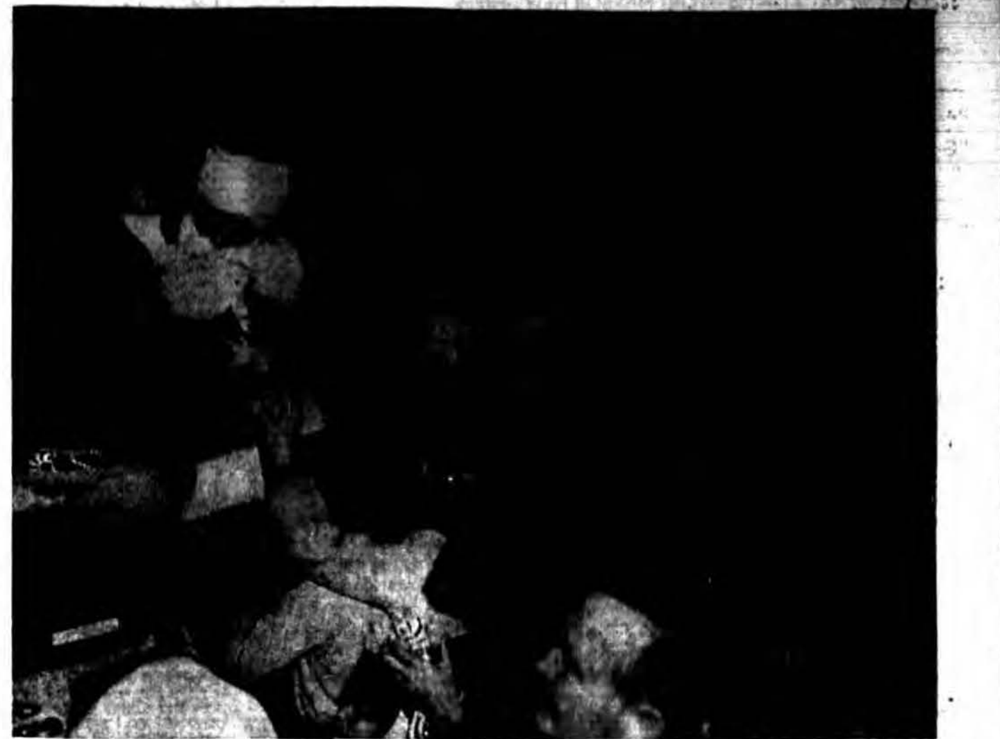
CHILDREN OF ALL AGES TURN OUT FOR SANTA This was the scene in Costa Mesa Park Friday night when Santa Clause himself started handing out the Christmas candy.