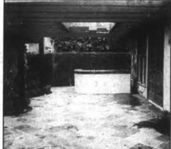
Custom Newport Beach patio with barbeque and patio cover with a gas heater above.

Angled pattern design with 12 x 12 multi-colored slate